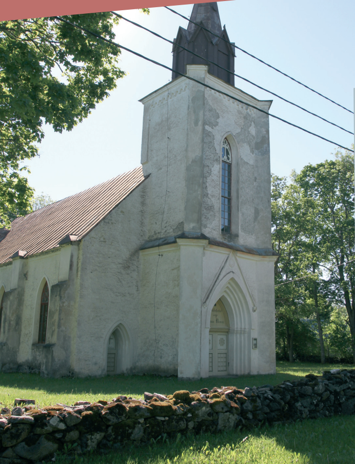
Near the farm museum there is Piirsalu church

The cultural heritage of Lääne county is preserved