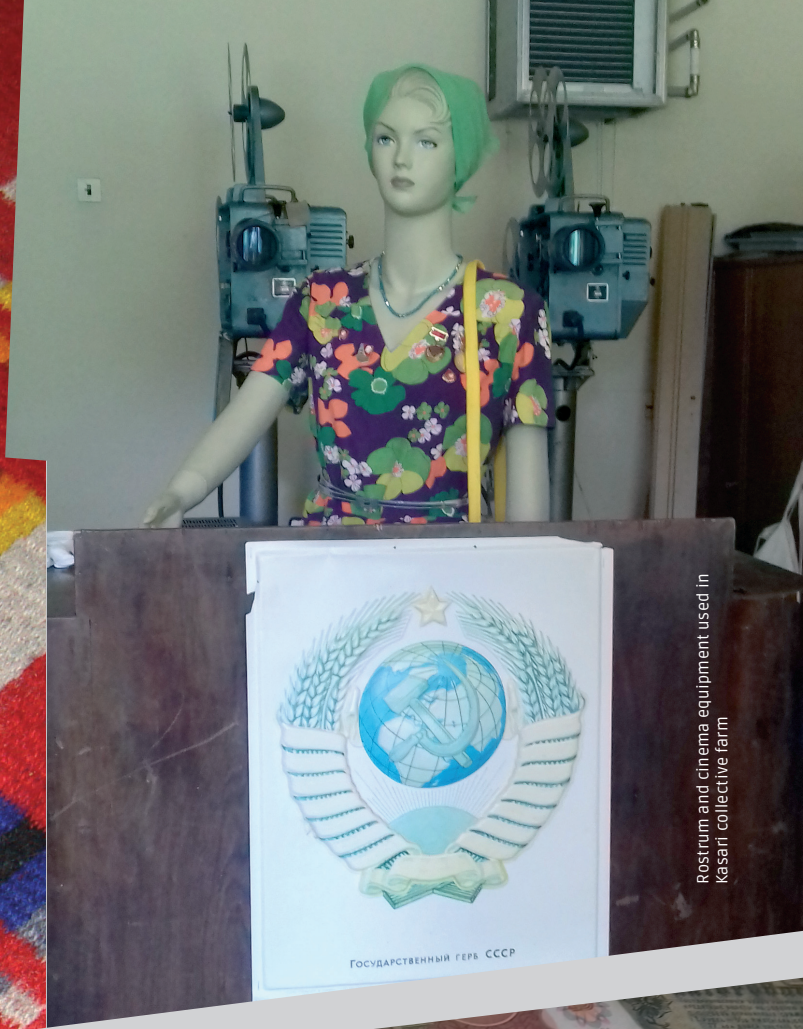
Rostrum and cinema equipment used in Kasari collective farm