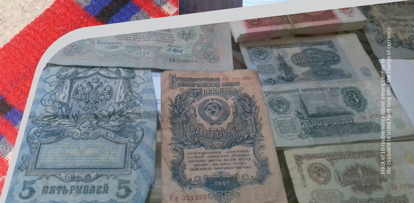
Stack of 10-ruble notes found among clothes in the cupboard in Urma farm long after the change of currency.