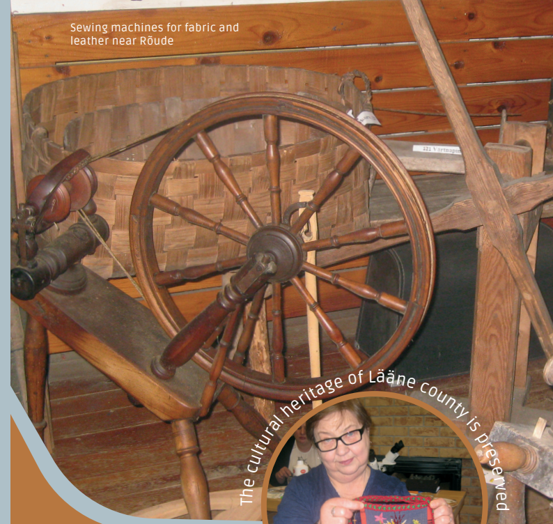
The cultural heritage of Lääne county is preserved