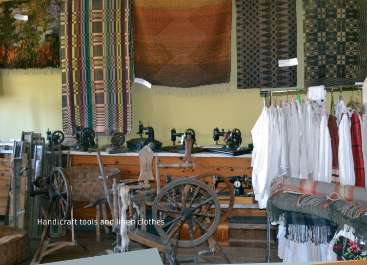
Handicraft tools and linen clothes

The expositions provide an overview of the former life led in Martna parish and villages around Rõude