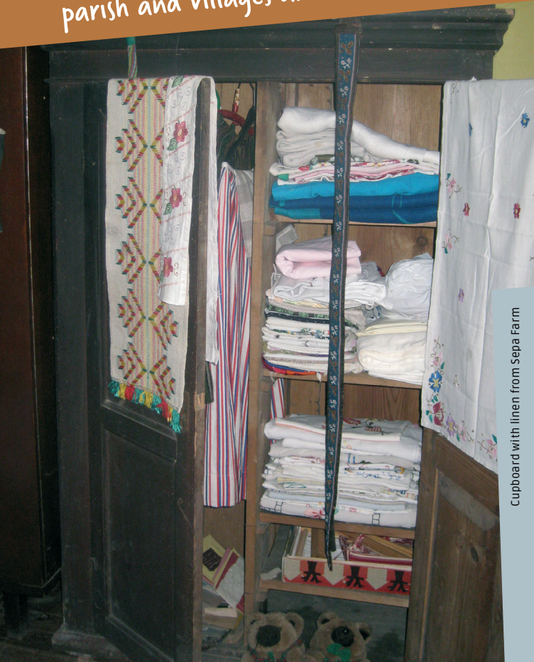
Cupboard with linen from Sepa farm

The expositions provide an overview of the former life led in Martna parish and villages around Rõude