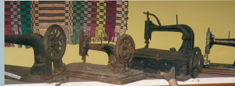
Sewing machines for fabric and leather near Rõude