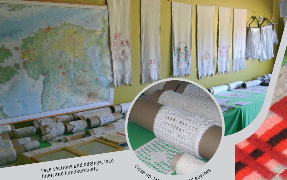
Lace sections and edgings, lace linen and handkerchiefs