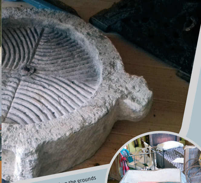
Herb press found on the grounds of Väike-Rõude manor