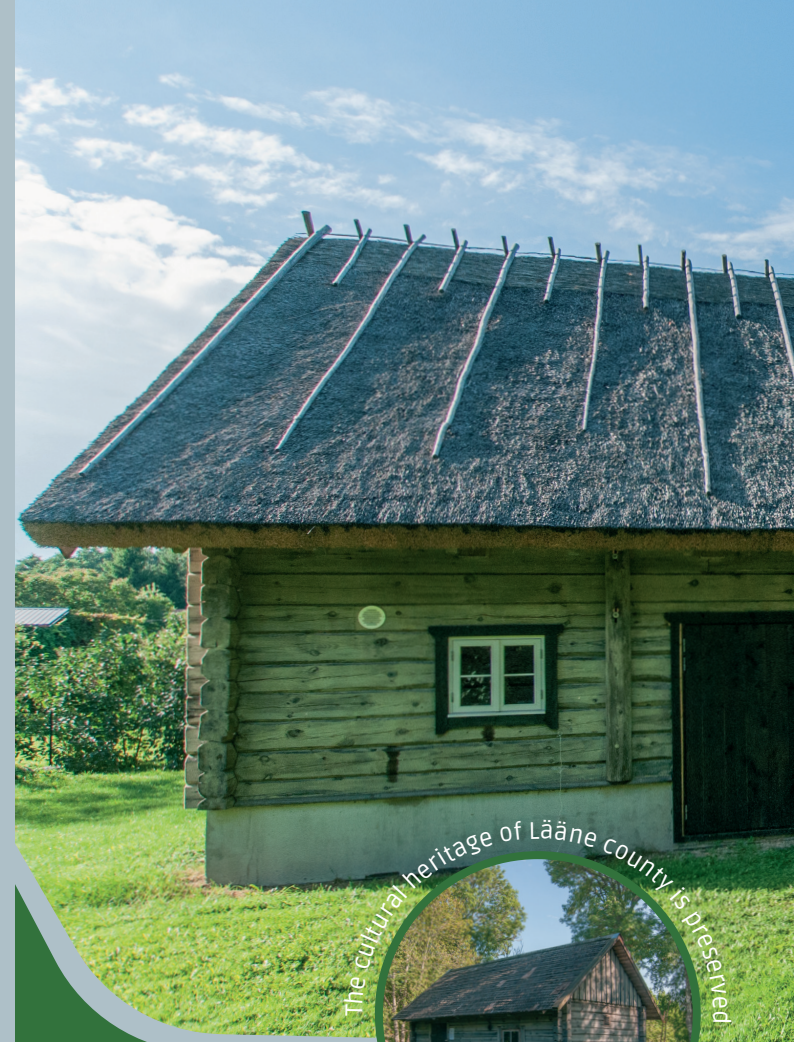
The cultural heritage of Lääne county is preserved