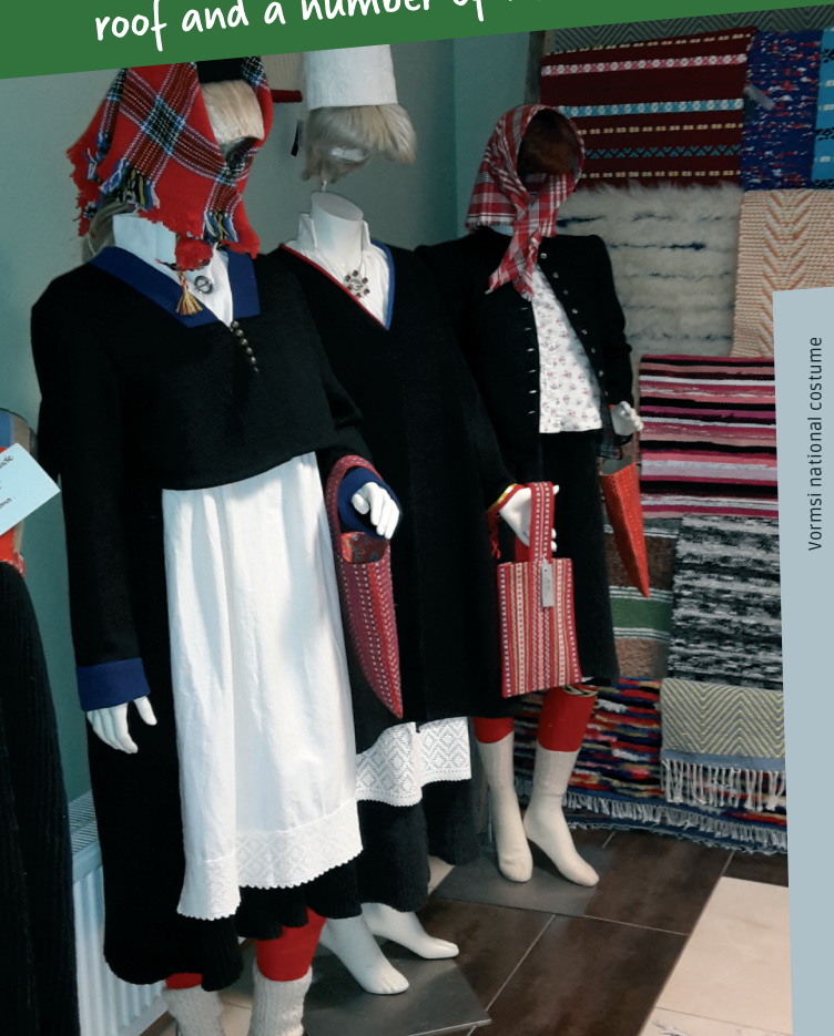
Vormsi national costume

Pearsi is one of the few remaining farms on Vormsi and allows us to see what life on the island was like in the early 20th century prior to the Second World War.