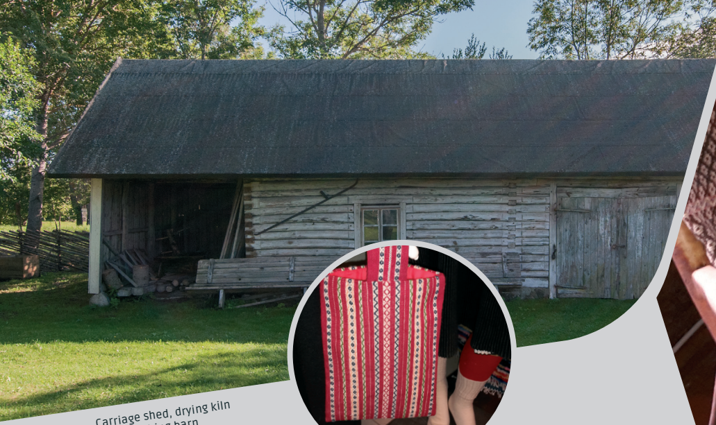
Carriage shed, drying kiln and threshing barn