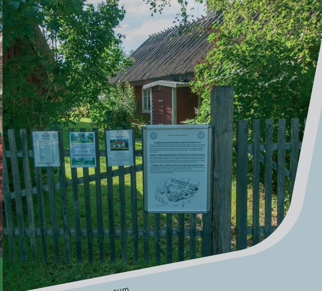
Vormsi Farm Museum

Here we can see a house and other constructions with a typical thatched roof and a number of various tools