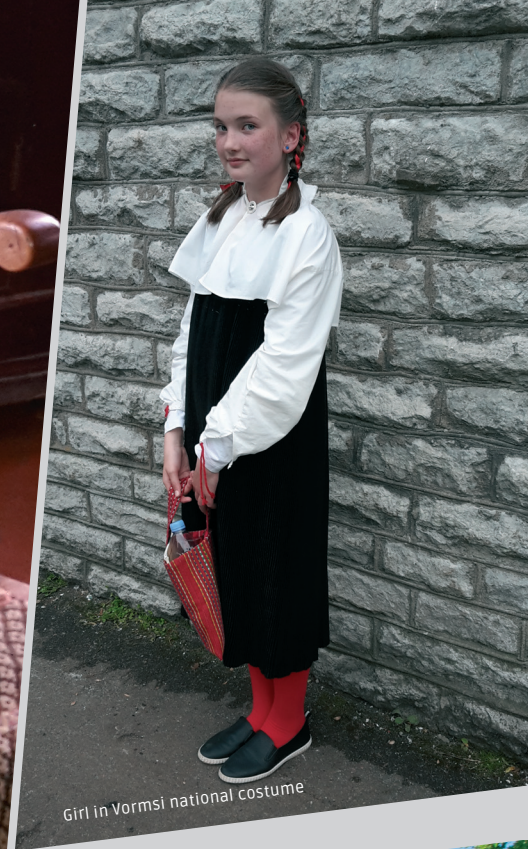
Girl in Vormsi national costume