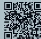
Museum address QR code