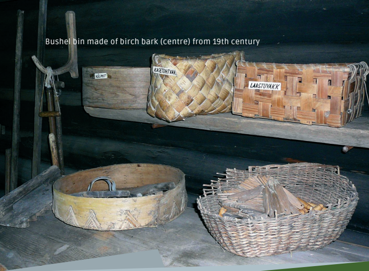
Bushel bin made of birch bark (centre) from 19th century

All 10 buildings have been preserved: barn, smoke sauna, garner, cellar, washing room, residential building, mill shed (flour mill and sawmill) etc.