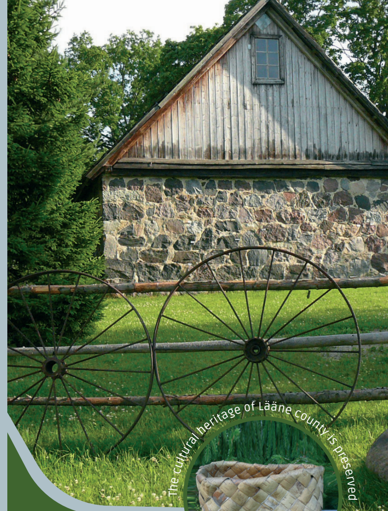
The cultural heritage of Lääne county is preserved