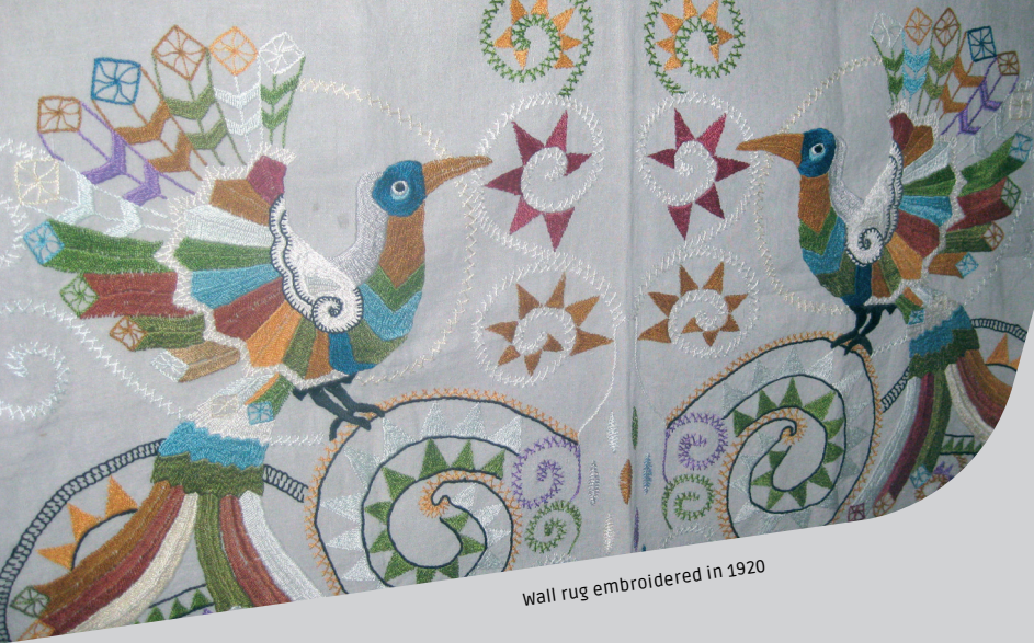
Wall rug embroidered in 1920

The farm was established in 1883. The first building on the estate – the house barn – includes the exposition of old farm tools (flail for threshing, winnowing machine) and handicraft tools (flax breaker, spinning wheel, wrap reel, loom).