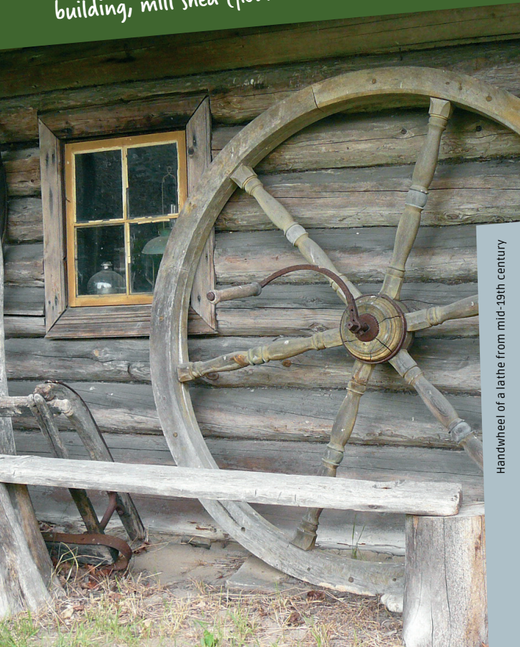
Handwheel of a lathe from mid-19th century

All 10 buildings have been preserved: barn, smoke sauna, garner, cellar, washing room, residential building, mill shed (flour mill and sawmill) etc.