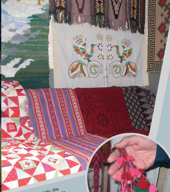
Rugs and blankets, the oldest – striped – is made between 1870-1880