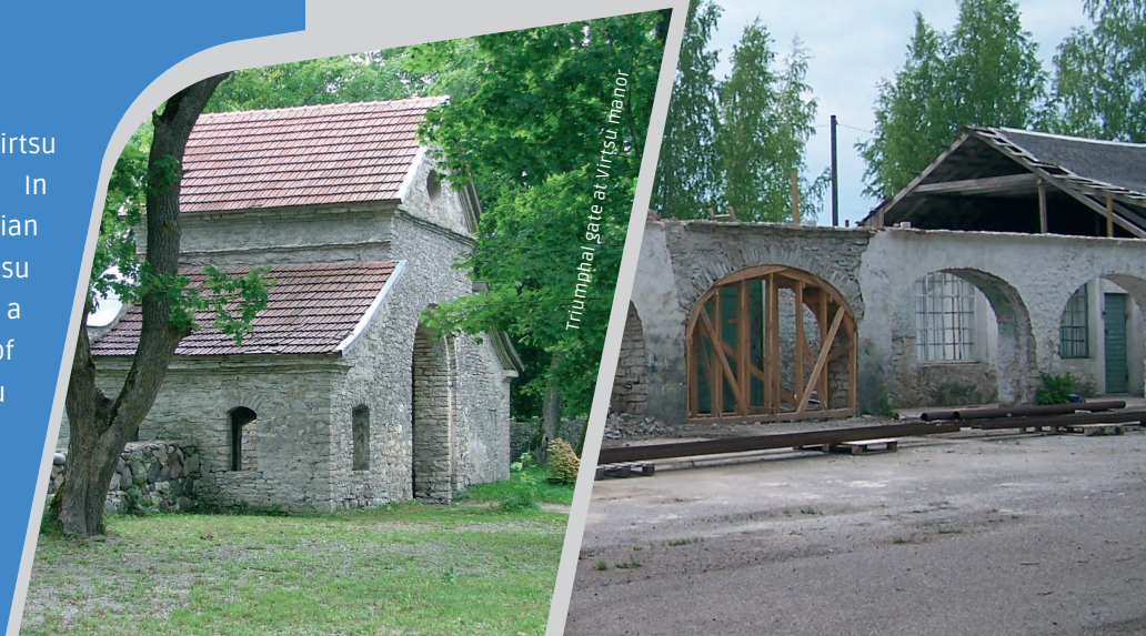
Triumphal gate at Virtsu manor