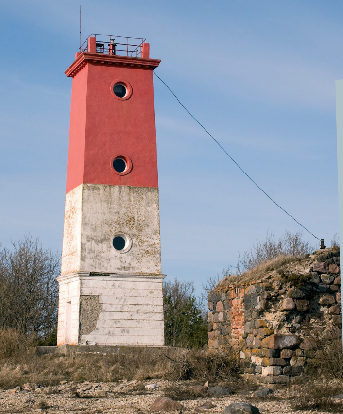
The third lighthouse in Virtsu in 1951

Virtsu is located on a peninsula of the same name with its surface area together with Puhtulaid Islet expanding over about 7 km 2