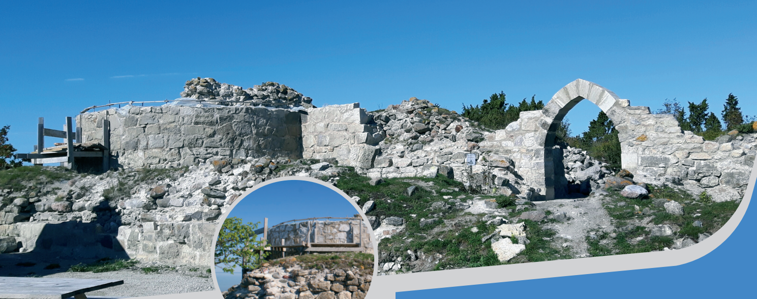
Renovations on Virtsu castle hill