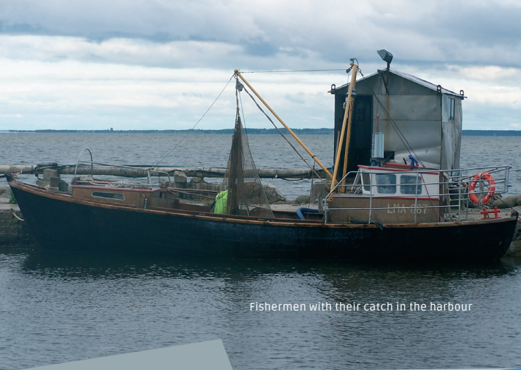
Fishermen with their catch in the harbour