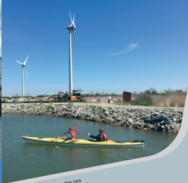
Kayaking on the sea