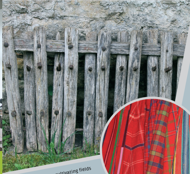
Spike harrow for cultivating fields