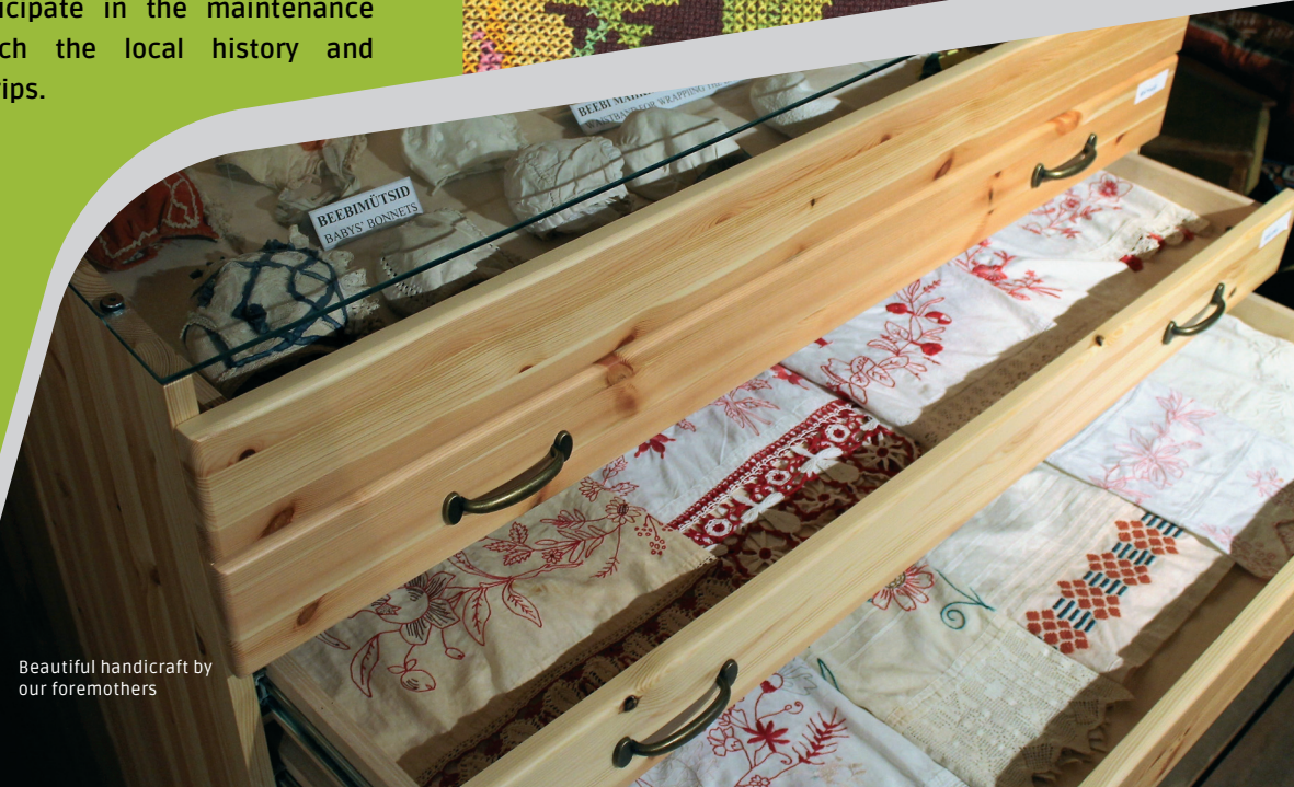
Beautiful handicraft by our foremothers