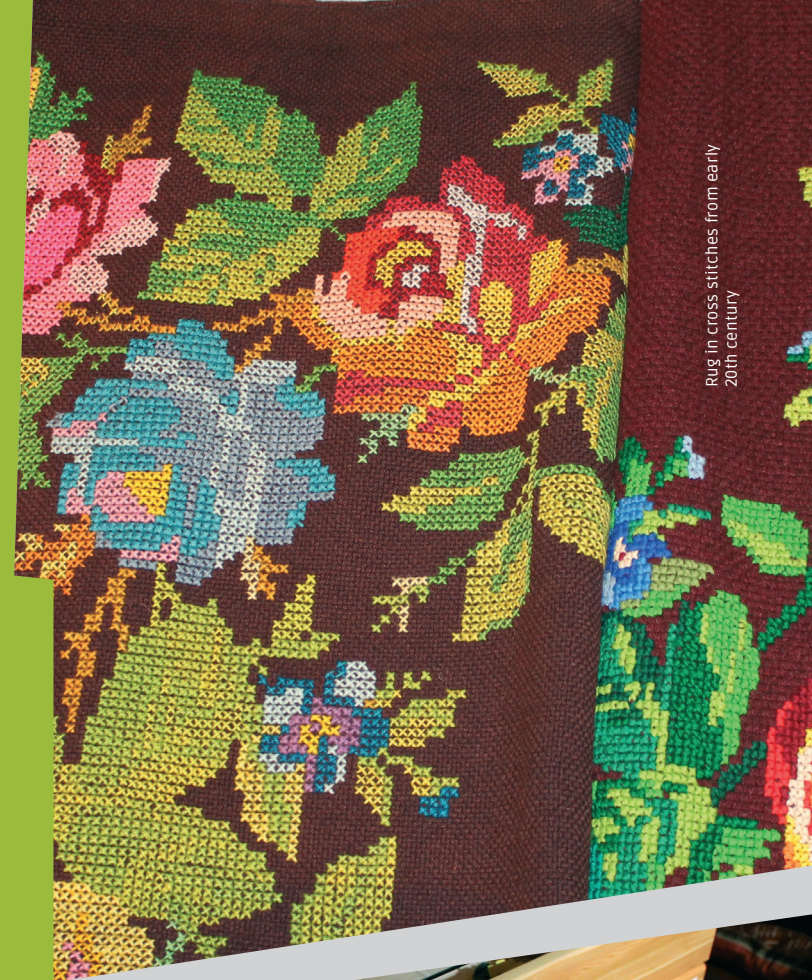
Rug in cross stitches from early 20th century

The museum is supported by Hanila Museum Society who participate in the maintenance activities, research the local history and organise various trips.