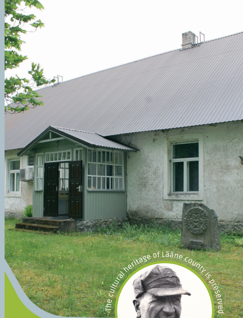
The cultural heritage of Lääne county is preserved