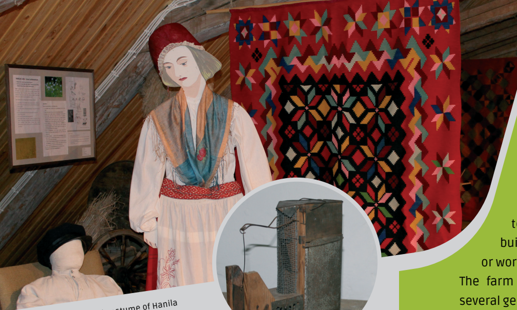
National costume of Hanila and Karuse parish